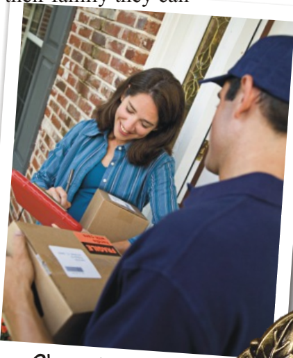
Shopping Spree and Prizes

Not only do you receive a SafeStart Dream Vacation for your company, but you get a designated number of award prizes and special reports showing which of your employees are participating.